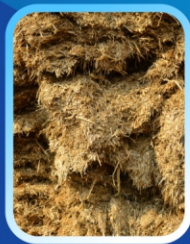
Biomass waste from food crops