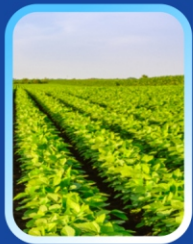
Farming for food or other non-textile reasons