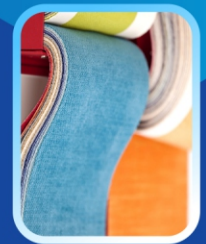
Knitted & Woven Fabric from Altag Yarns