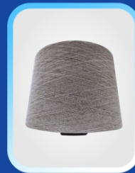
Altag yarns (different counts and blends)